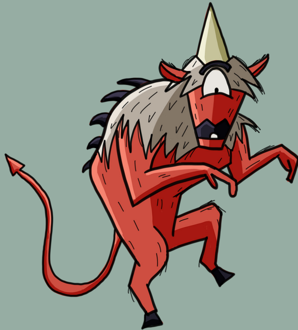
MINIWSHITU The Not-So-Sneaky