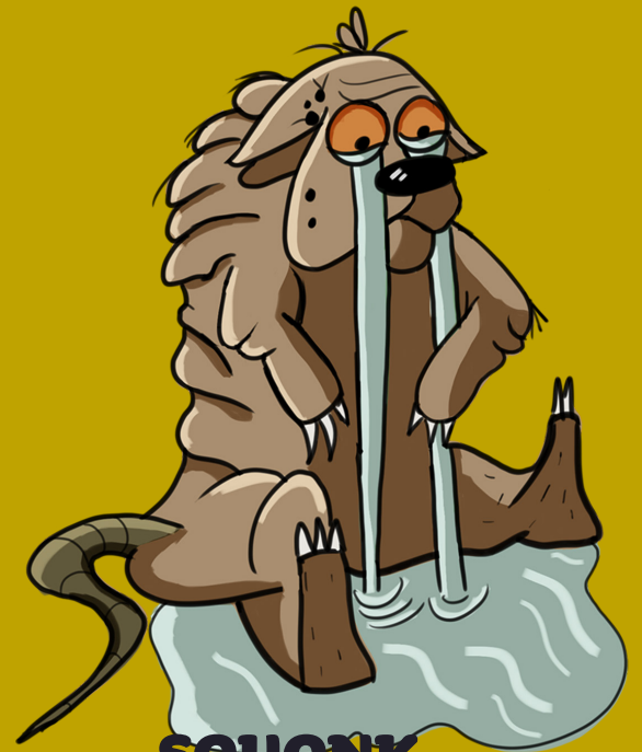
SQUONK The Cover-up Artist