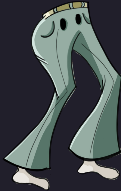
NIGHTCRAWLER The Contortionist