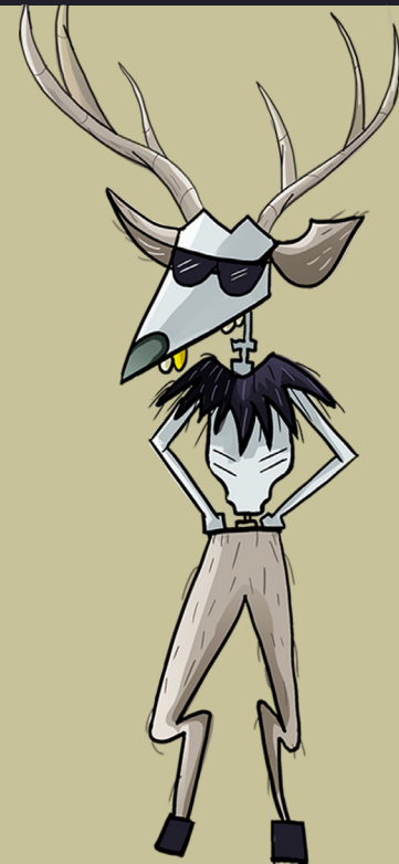
WENDIGO The Ringleader