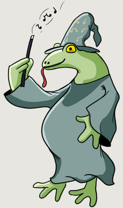
FROGMAN The Disenchanted Composer