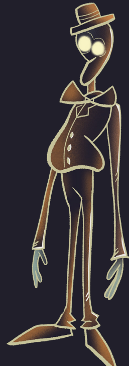
DARK WATCHER The Devious Salesman