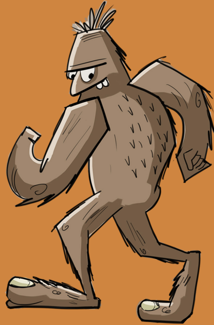
BIGFOOT The Voice of Reason